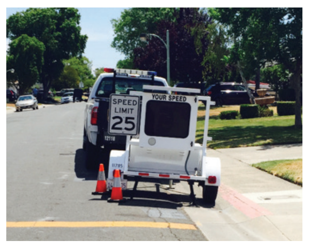
Temporary radar speed sign on Irvin Way.

sues about aging in the community, and to provide resources or assist with referrals to more formal services if the need for that arises.